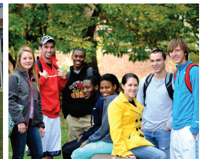
Posed group, no activity