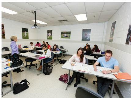
To far away and unengaging